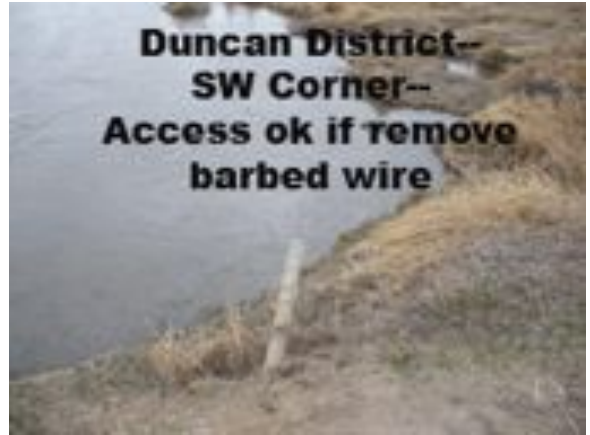
Duncan District-- SW Corner-- Access ok if remove barbed wire