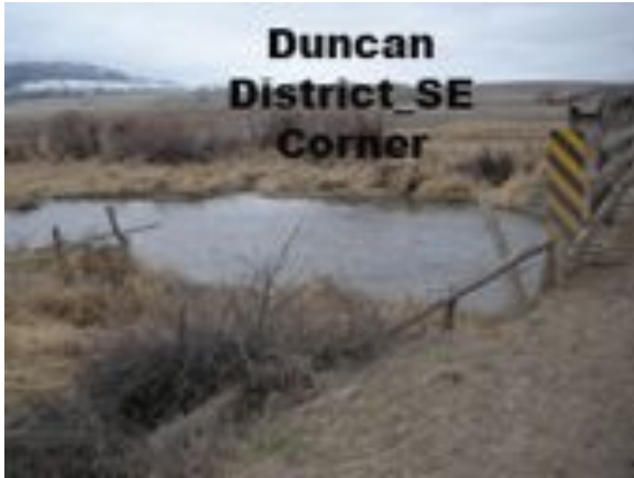
Duncan District_SE Corner