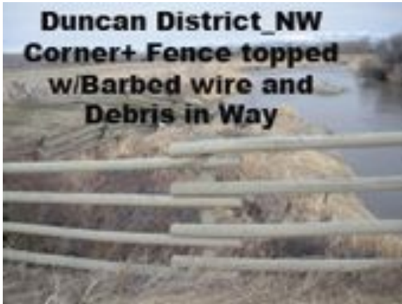
Duncan District_NW Corner+ Fence topped w/Barbed wire and Debris in Way